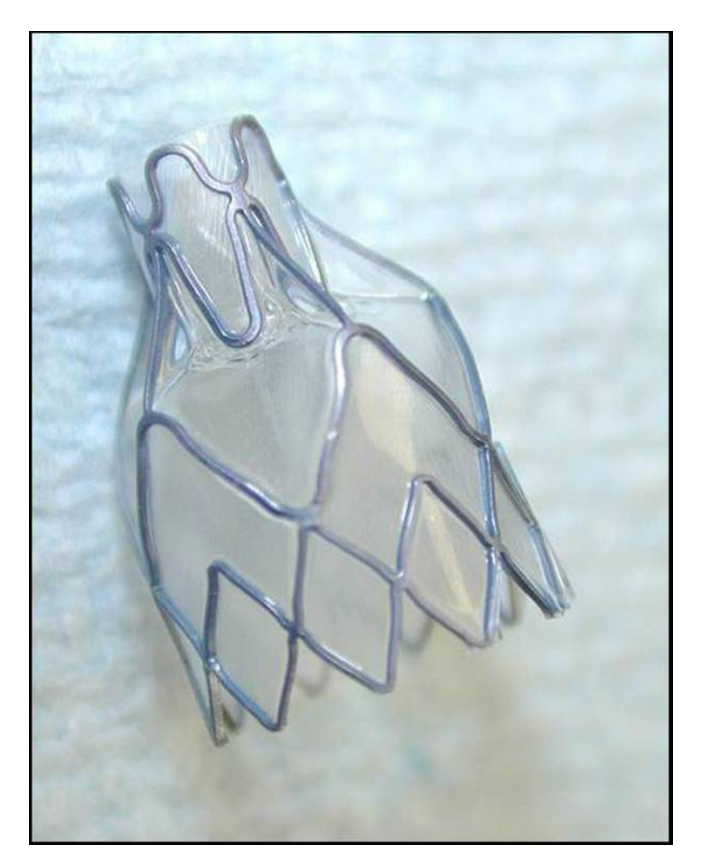
Figure I Zephyr<sup>®</sup> Endobronchial Valve side view.